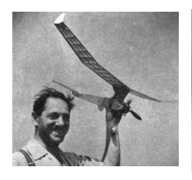
You'll smile, too, when you see how your Strato-Streak can climb

You don't know climb until you've built one of these flying bullets. Good soarer, too.