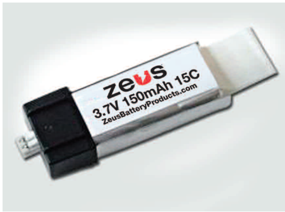
LIPO 1S 150MAH